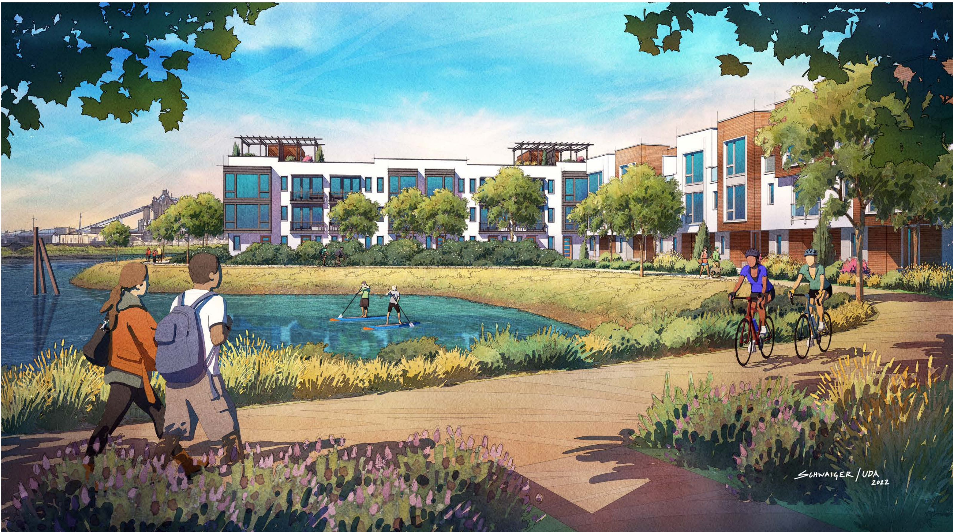
VIEW 2 | MCNEAR CHANNEL