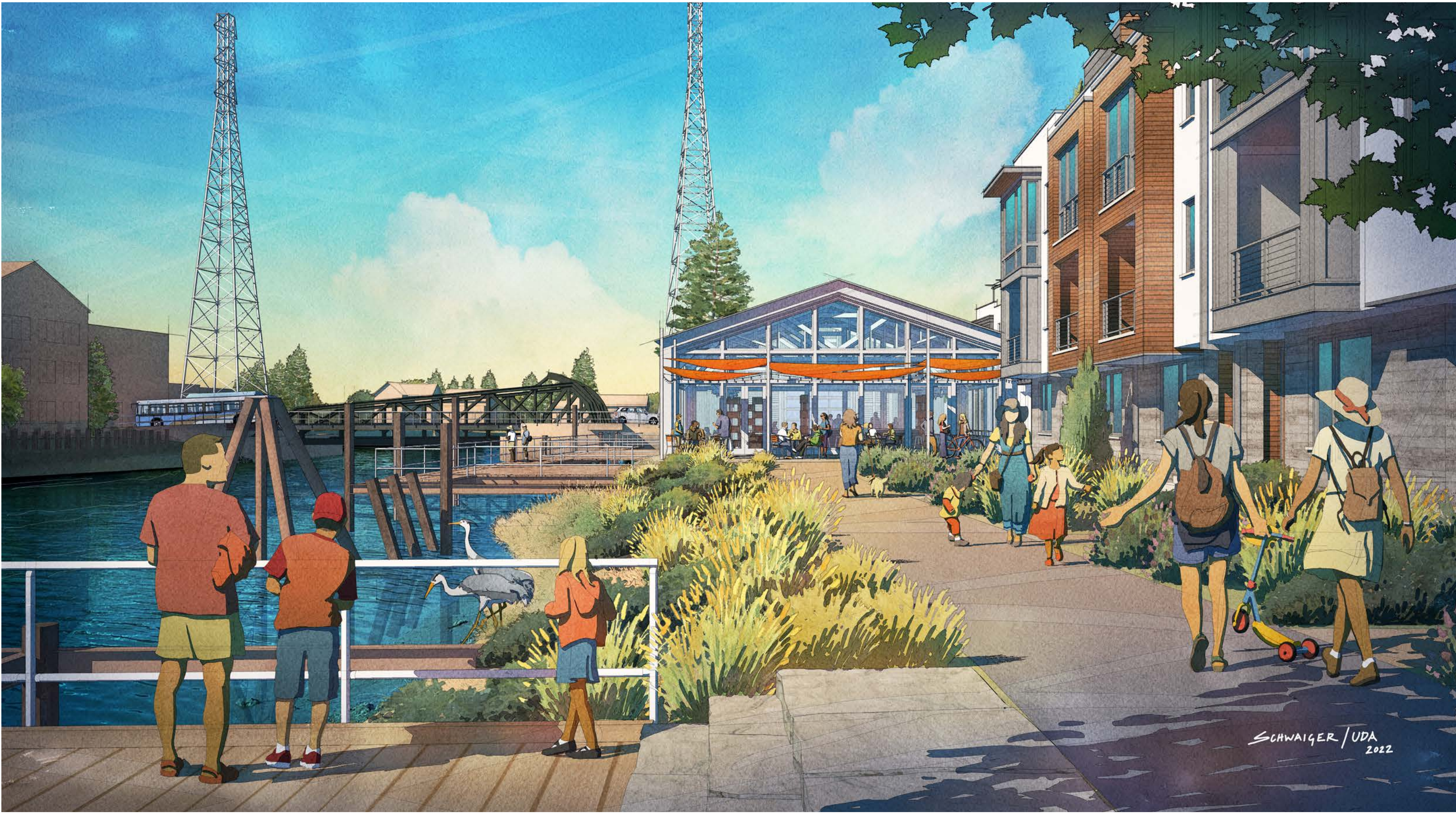
VIEW 4 | PETALUMA RIVER