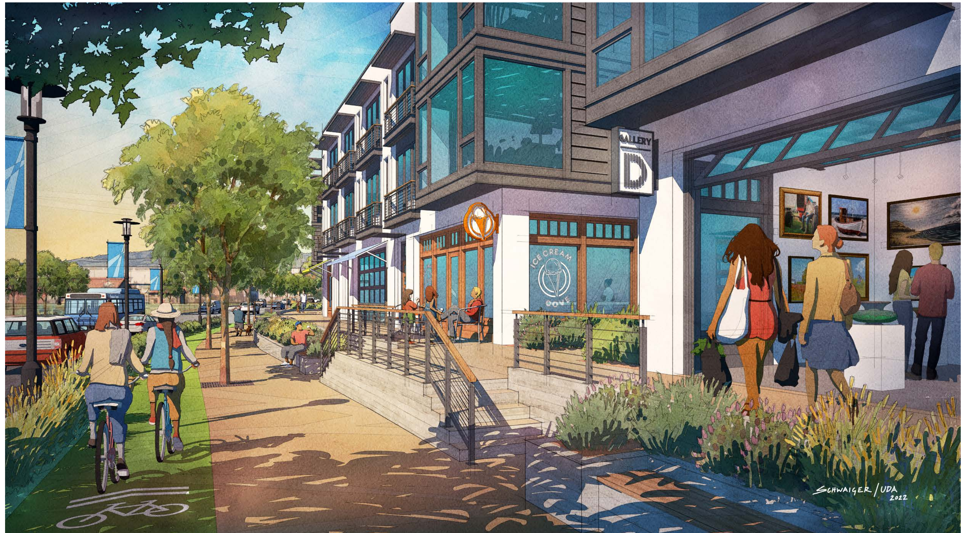
VIEW 1 | EAST D STREET