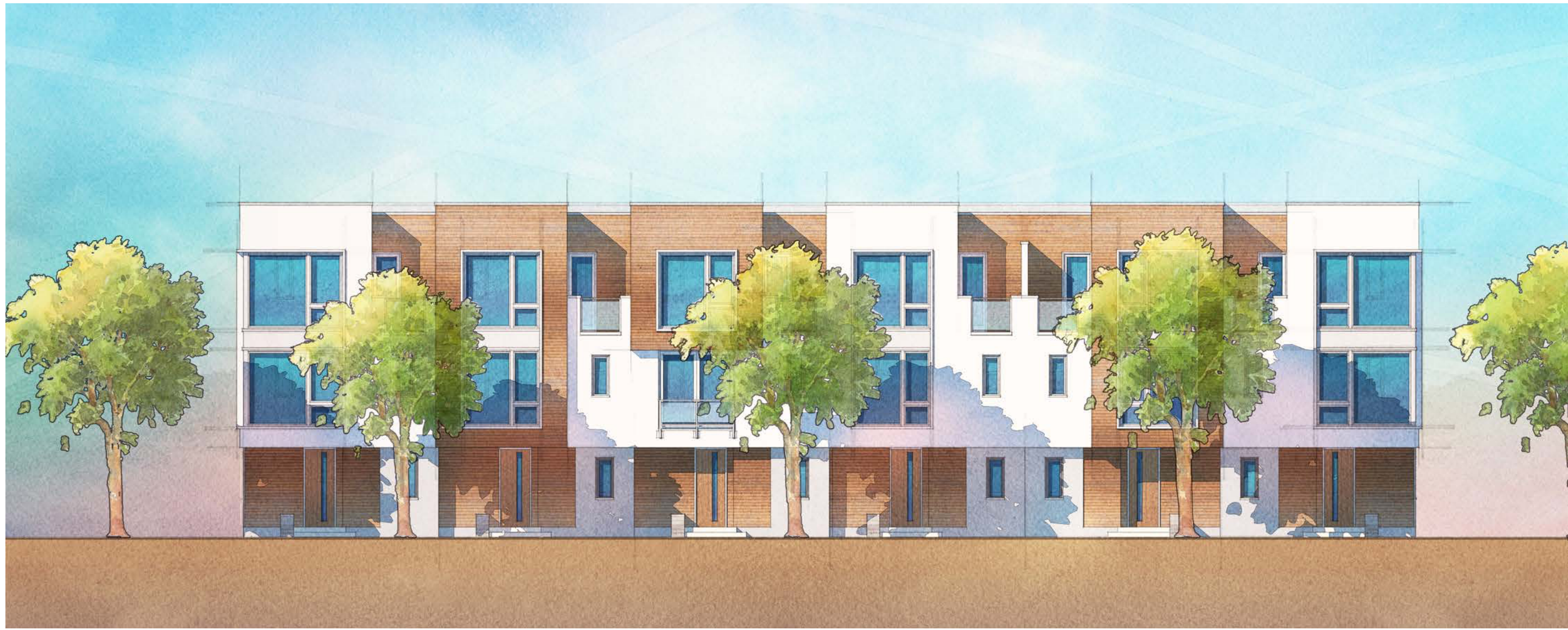
BUILDING 18 (TYPE 4 ● )