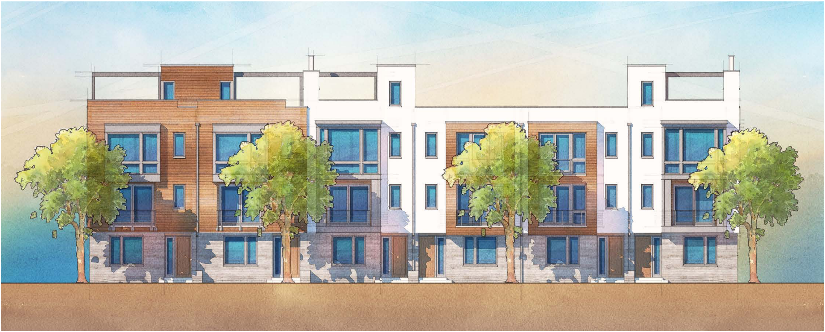
BUILDING 14 (TYPE 3 ● )