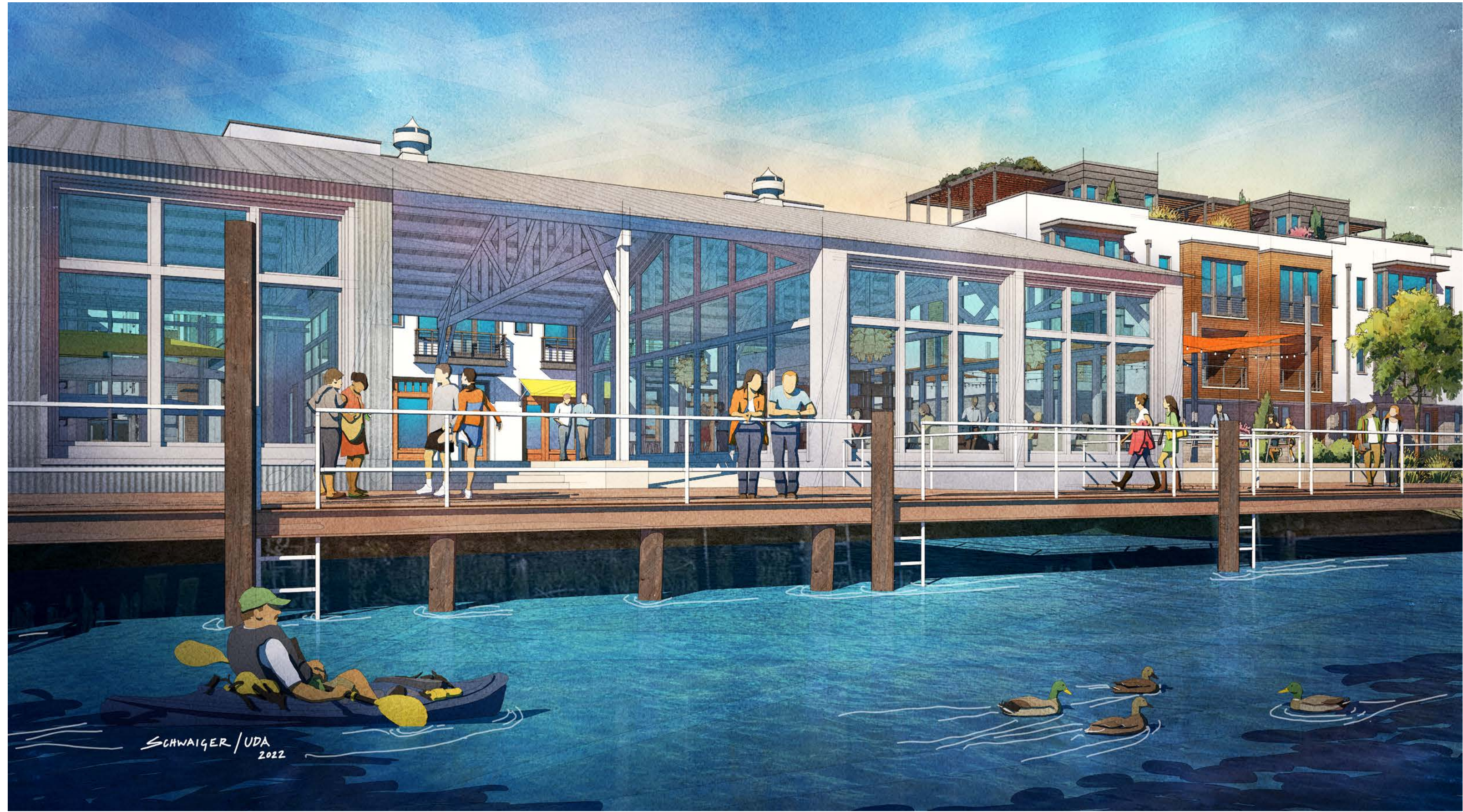
VIEW 3 | ADAPTIVE RE-USE OF THE OYSTER SHED