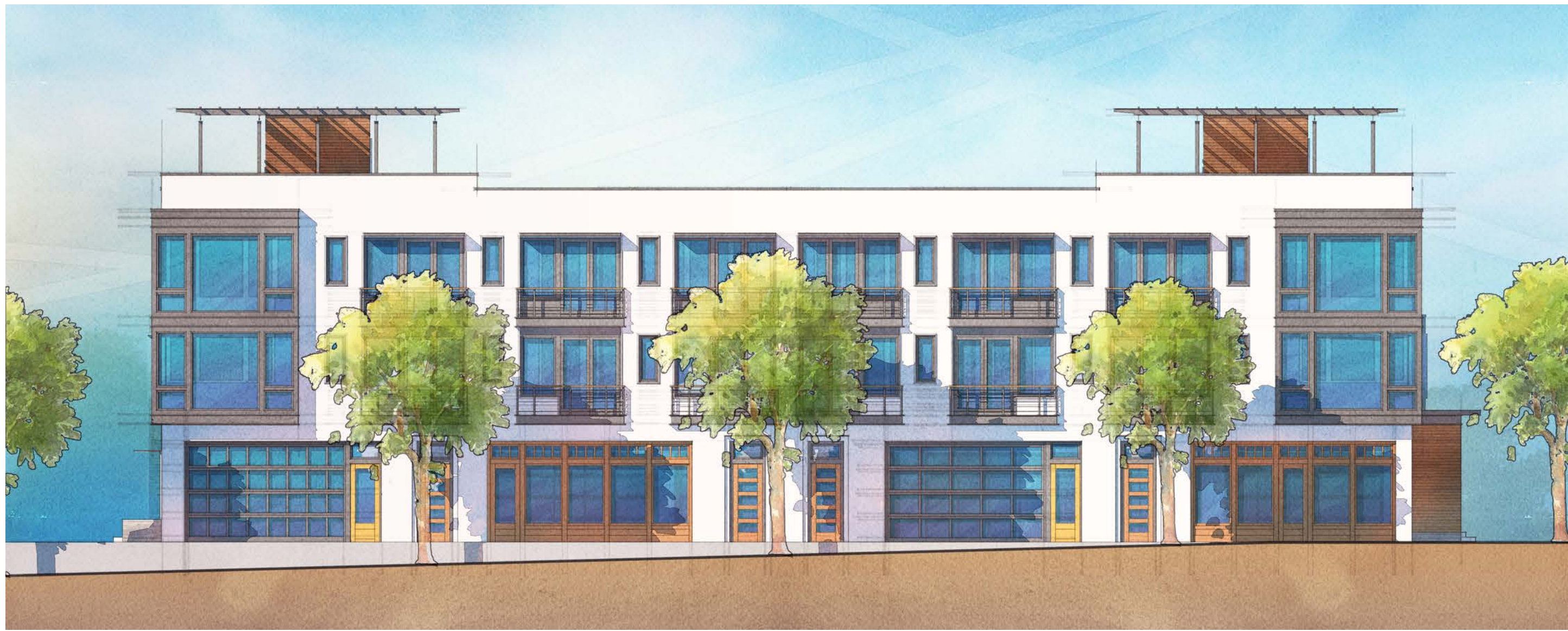
BUILDING 2 LIVE WORK (TYPE 1A ● )