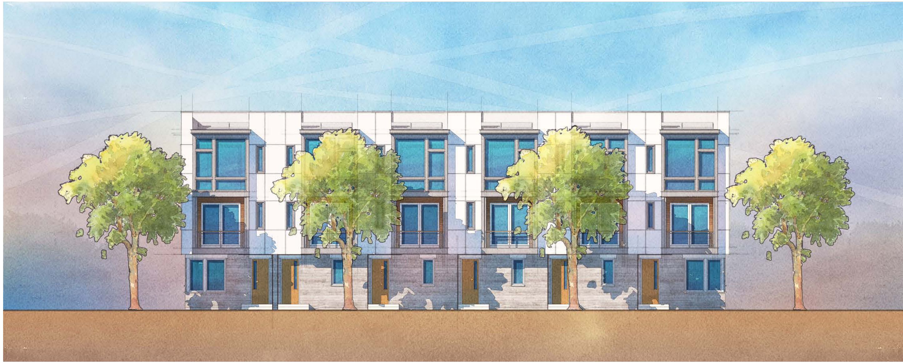
BUILDING 4 (TYPE 2 ● )