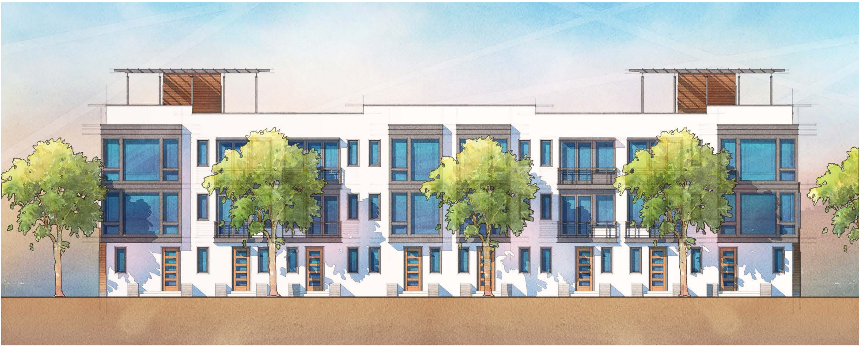
BUILDING 13 (TYPE 1B ● )